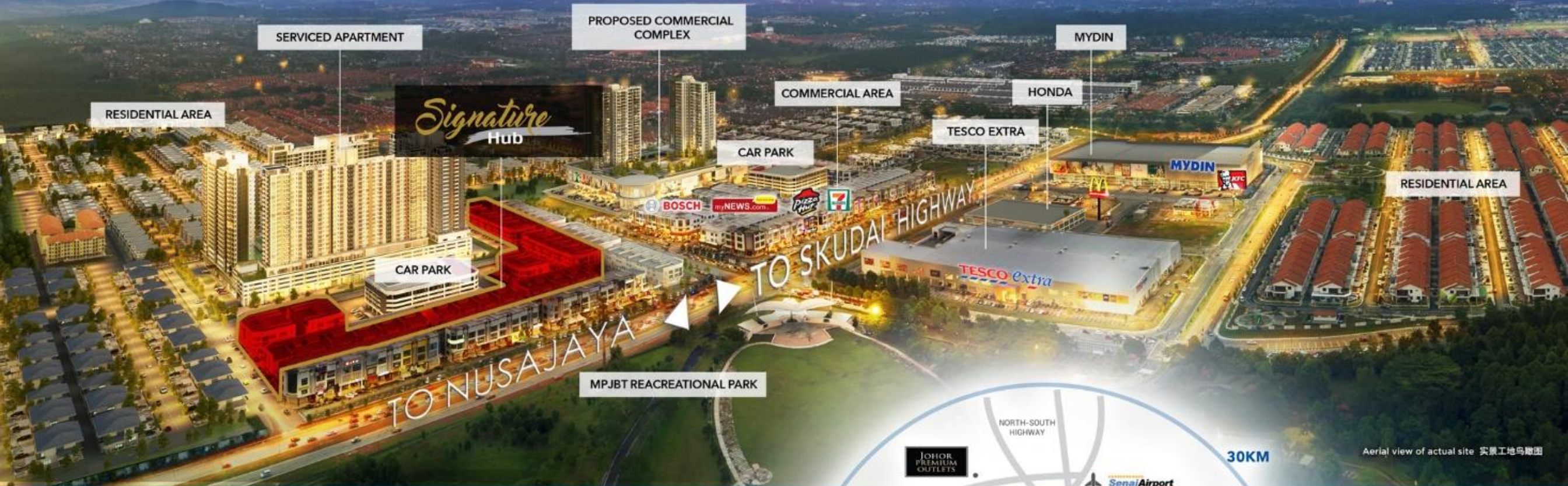
Aerial view of actual site 实景工地鸟瞰图