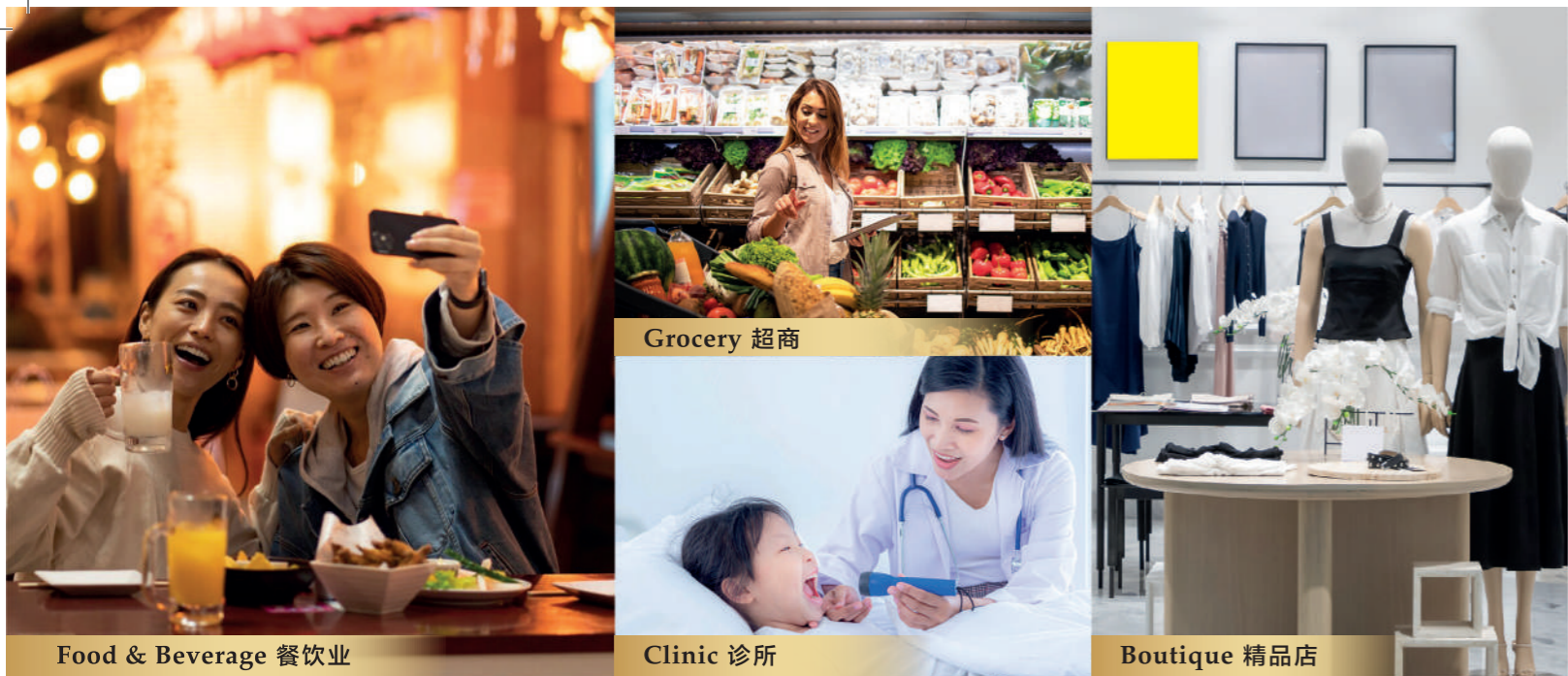
Food & Beverage 餐饮业