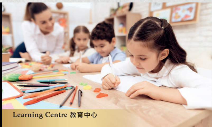
Learning Centre 教育中心