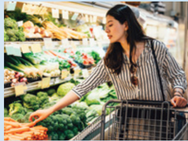
Supermarkets & Grocery Stores