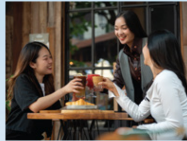
Food & Beverage Dining